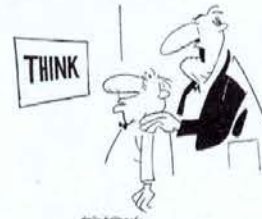
"You're fighting it!"